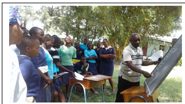
Left: Students electing their prefects through secret ballots and Right: The School Administrator tallying the election results.