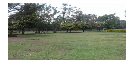
Top: The Animal shed housing the cows, goats and sheep; the fence that enclosed the football pitch and left; the trimmed compound of St. Teresa’s